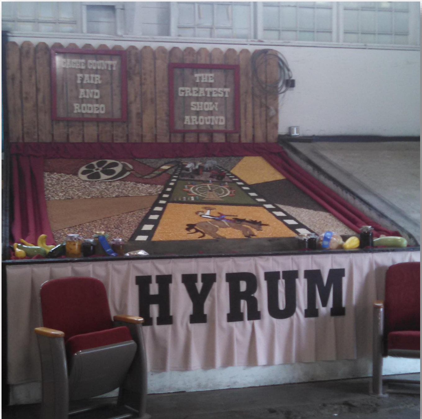
HYRUM CITY'S COMMUNITY BOOTH CACHE COUNTY FAIR "THE GREATEST SHOW AROUND" 2015 SWEEPSTAKES WINNER